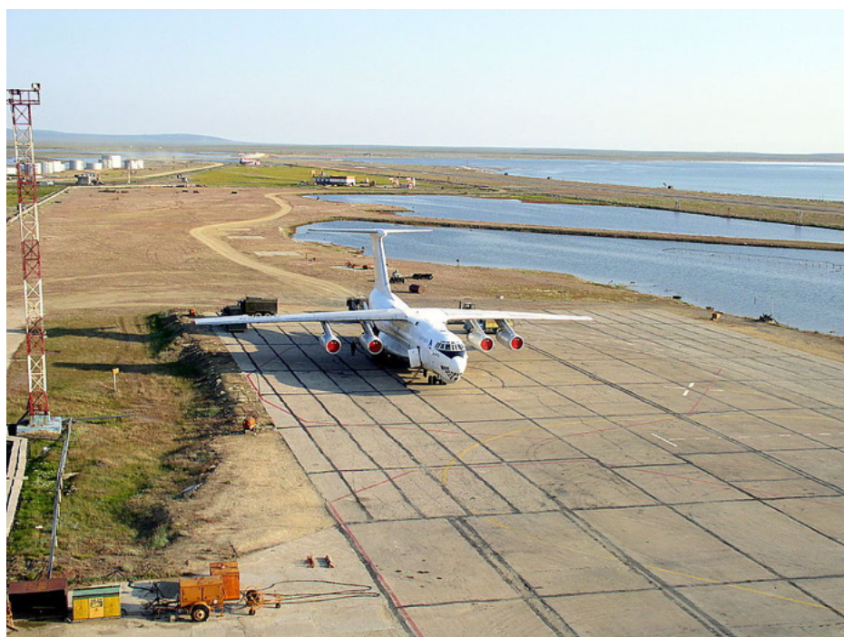
Pevek airport (Apapelgino)

September 14, 2020, AEX.RU - Overhaul of the runway (runway) of the airport of the northernmost city of Russia - Peveka in Chukotka was postponed to 2021. Due to the closure of borders during the pandemic, the contractor was unable to bring the necessary number of foreign specialists to Russia. This is reported by TASS with reference to the data of the district government.